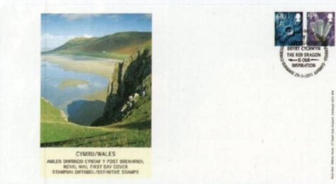
Royal Mail First Day Covers and First Day Envelopes are available with images of Cymru/Wales, England, Northern Ireland and Scotland