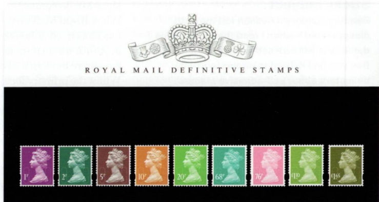
Right: the 2011 Definitive Stamps Presentation Pack, issued on 29 March, includes the four new tariff values and the five Make-up varieties

New 2011 Machin definitives New postal rates come into effect on Monday 4 April and four new definitives, as shown above, will go on sale this month, on Tuesday 29 March: 68p Sea green, 76p Pink, £1.10 Lime Green and £1.65 Sage. The new stamps are self-adhesive, with iridescent print and will be gravure printed by De La Rue in sheets of 25.